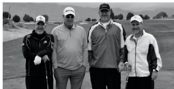
Congratulations to first place team, Business Environments, the Lexus team for conceding first place, and to all who played!