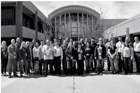
LGLP participants learned about the world of print publishing during their tour of the Albuquerque Publishing Company / Albuquerque Journal.