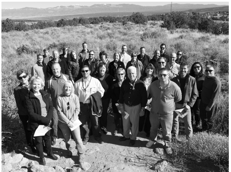
2015 Core Class at the archeological site of Tsierge in Los Alamos.

The session was extremely fun and successful, thank you to the Los Alamos community, the Core Program committee members and the following sponsors: Haverland Carter Lifestyle Group, Crystal Spring Bottled Water, and Los Alamos County.